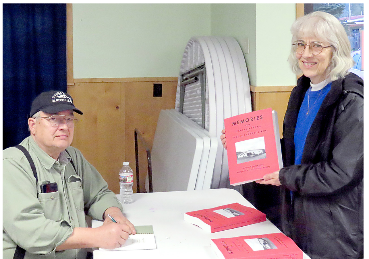
Buddy Rose | East County Journal

It is a large collection See Red Book Page 2